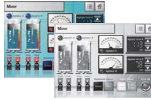
Support for Monochrome Display